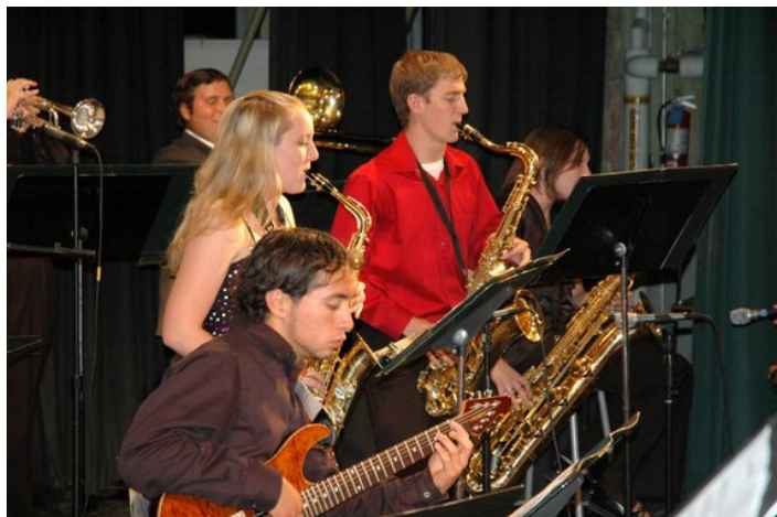
68 West (above) and the ASC Jazz Band (below) perform at the Homecoming Jazz Concert